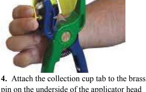
pin on the underside of the applicator head