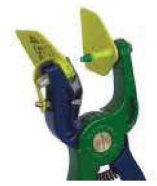
5. The Tissue/DNA Ear Tag is ready for application.

3. Snap the female portion of the ear tag into the collection cup and slide it under the metal clip. Snip the 2 thin strands of plastic that are connecting the back of the ear tag to the collection cup.